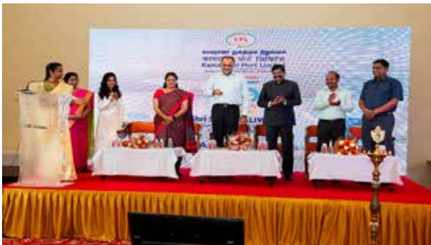
Release of 25th Year Logo of KPL