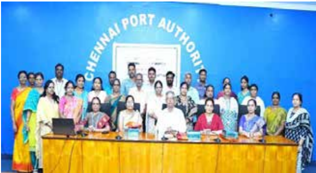
Hindi Workshop organized jointly by KPL and ChPA