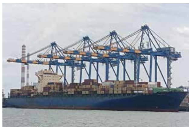
M.V. Maersk Stadelhorn