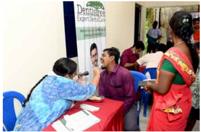
Medical Camp organized by KPL