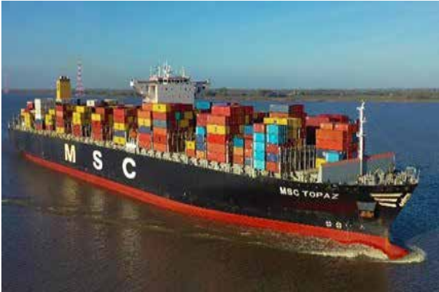
MV MSC TOPAZ, the largest vessel called at KPL