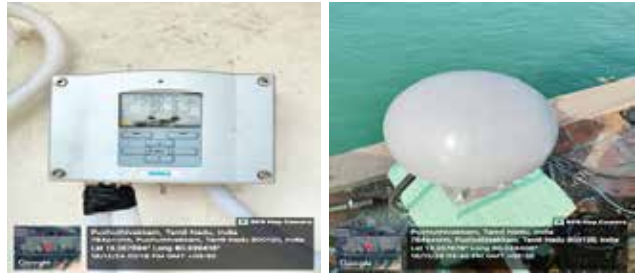
Global Navigation Satellite System

A Global Navigation Satellite System (GNSS) installation has been established at the Port by the Indian National Centre for Ocean Information Services (INCOIS), Ministry of Earth Sciences, as part of a Pilot Project. This installation significantly enhances the accuracy and reliability of hydrographic surveys, tidal observations, and positioning data. Precise positioning is critical for safe navigation, efficient port operations, dredging activities, and infrastructure development. The GNSS setup supports real-time data acquisition and improves the overall quality of marine and coastal data management at the Port.