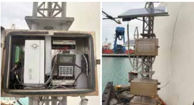
Automatic Tide Gauge Monitoring System

The Port ensures continuous and systematic maintenance and recording of tidal data through the operation of its Automatic Tide Gauge system, in coordination with the Indian National Centre for Ocean Information Services (INCOIS), under the Ministry of Earth Sciences. The real-time data collected is vital for internal operational planning, navigation safety, infrastructure development, and supports hydrographic and other maritime operations. Furthermore, the tidal data is forwarded monthly to the Indian Navy, National Hydrographic Office, Dehradun, for national safety and security related purposes.