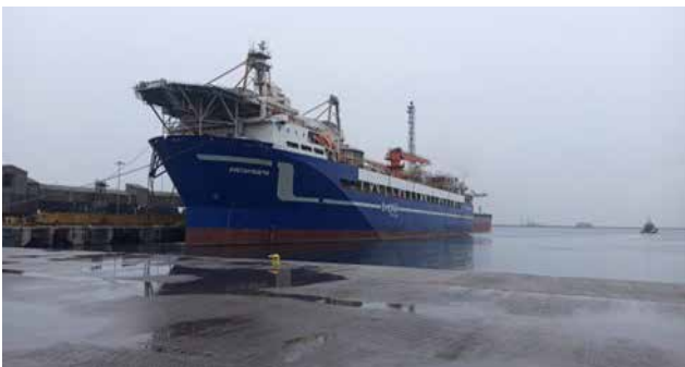
Svetha Venetia – Floating Production Storage and Offloading Vessel