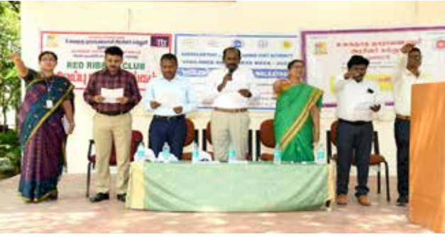
Vigilance Pledge administered to school and college students

Training programs on Ethics and Governance, Cyber Hygiene and Security, Procurement and Disciplinary proceedings were conducted at Chennai Port for Port employees.