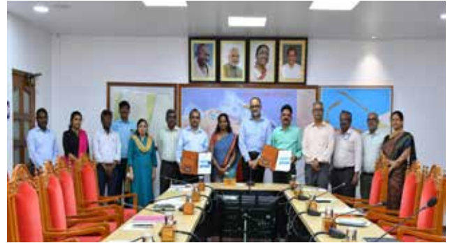
Kamarajar Port Limited signed MoU 2024-25 with Chennai Port Authority

The Memorandum of Understanding (MoU) for the year 2025-26 was signed with Chennai Port Authority on 15.07.2025. The MoU rating for financial year 2024-25 is 'Very Good'.