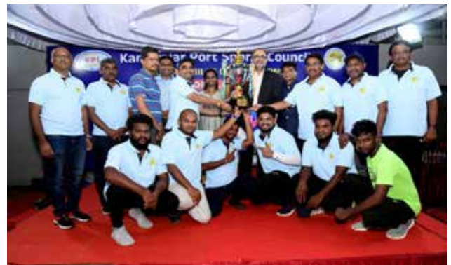
Winners of the Cricket Team receives Trophy