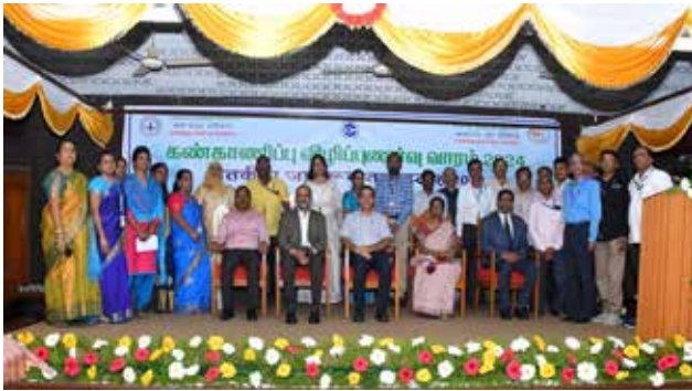
Vigilance Awareness Week 2024

Training programs on Ethics and Governance, Cyber Hygiene and Security, Procurement and Disciplinary proceedings were conducted at Chennai Port for Port employees.