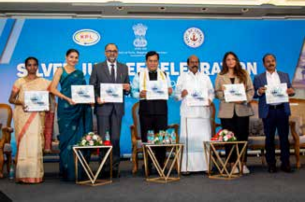
Release of Master Plan 2047 by Shri Sarbananda Sonowal, Union Minister of Ports, Shipping & Waterways, GoI.

Thiru E.V. Velu, Hon'ble Minister for Public Works, Highways & Minor Ports, Government of Tamil Nadu graced the function with his august presence.